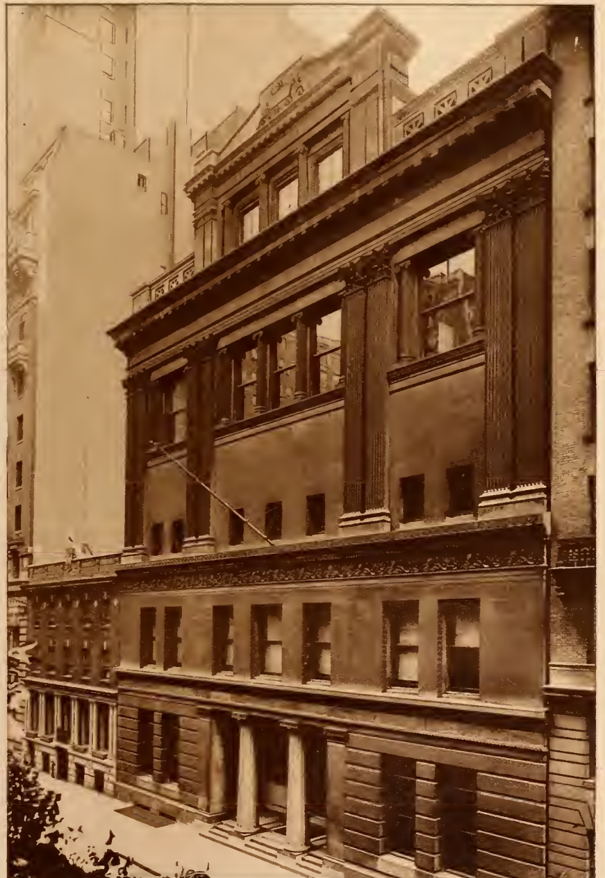
BAR ASSOCIATION, situated on 44th Street. The seat of the most powerful lawyers' organization of the United States.